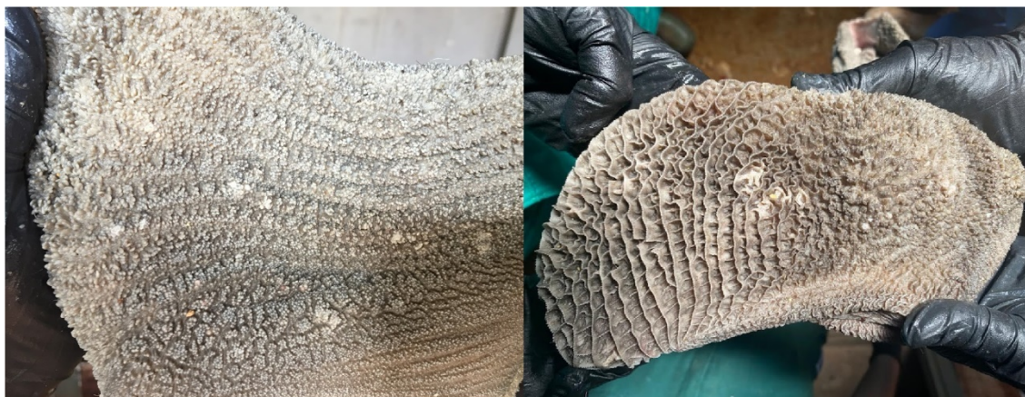
Figure 3. Occurrence of parakeratosis in calves fed concentrate containing reconstituted corn grain silage