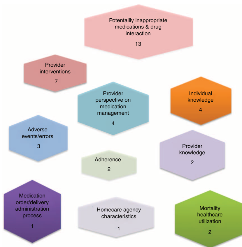
Figure 2. Map of outcomes measured by number of studies in the exemplar scoping review.

At the time of protocol development, the reviewers should detail a proposed plan for presenting the results. This may then be further refined toward the end of the review when the reviewers have the greatest awareness of the contents of their included studies. In our exemplar