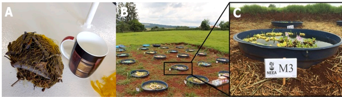
Fig. 1. Colonization structures (A); overview of outdoor mesocosms (B); zoomed-in view of a mesocosm contaminated with the pesticide mixture (C).

stage), considering a total drift scenario in which 100% of the compounds would reach the aquatic surface, as described by Pinto et al. (2021a). The recommended pesticide doses are 3.5 L ha -1 of DMA® 806BR (equivalent to 2.35 kg of active ingredient ha -1 ) and 500 g ha -1 of Regent® 800WG (400 g of active ingredient ha -1 ). Therefore, considering the volume of the experimental units, 678 mg of 2,4-D ( i.e. , 1 mL of the commercial product) and 96 mg of fipronil ( i.e. , 120 mg of the commercial product) were added per mesocosm. Each mesocosm contaminated with vinasse received 20 L, as per regional recommendations (Pinto et al., 2021a). The expected nominal concentrations were 447 µg L -1 for 2,4-D, 64 µg L -1 for fipronil, and 1.3% (v/v) for vinasse for both the individual and mixture treatments.