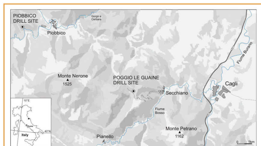
Figure 1. Location of the Poggio le Guaine drill site in the Umbria–Marche Basin (northern Apennines, central Italy). The location of the Piobbico drill site—where an 84-m-thick core extending from the upper Albian down to the uppermost Barremian was drilled in 1982—is also shown.

After three decades of dedicated research, the Aptian–Albian pelagic succession of the UMB has become a classical reference section for studies at regional to global scale. It deposited well above the calcite compensation depth at middle to lower bathyal depths (1000–1500 m) and at ~20°N paleolatitude over the southern margin of the western Tethys Ocean (Arthur and Premoli Silva, 1982; Coccioni et al., 1987, 1989, 1990, 1992; Erba, 1988, 1992; Cresta et al., 1989; Tornaghi et al., 1989; Coccioni,