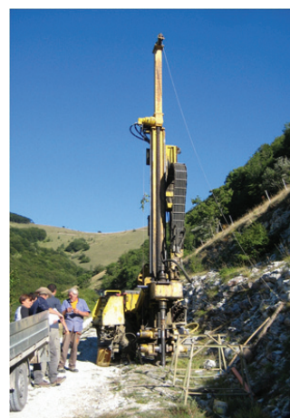
Figure 3. Drilling operations at Poggio le Guaine.

plastic boxes to prevent contamination and loss of moisture. During core packing, care was taken in collecting the fragments from the few fractured portions in plastic bags. The entire core is stored at the core repository of the Department of Earth, Life and Environmental Sciences, University of Urbino.