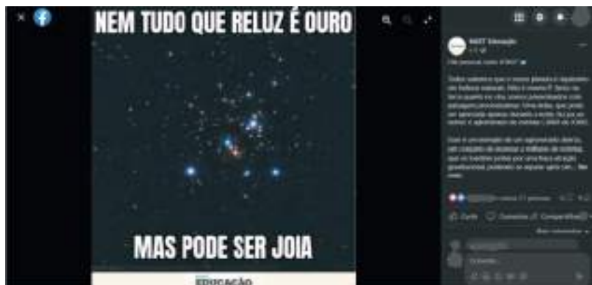
Figure 4: Online Museum Education post from 18 August 2023 on the profile of MAST's — Museu de Astronomia e Ciências Afins (Museum of Astronomy and Related Sciences) Coordination of Science Education (COEDU) – (Not everything that shines is gold but may be precious)

professional museum education, encouraging investment in the specific and continuing training of professionals working in the field". We can see that there is still a lot to be done and that the recent concern of public participation will still generate various debates and thoughts about how to be handled in the online museum space, be it in posts on social networks with images or video, workshops, commented message mediations or online visits. For the field of Museum Education in Brazil, 2 training courses are essential so that its professionals can exchange information