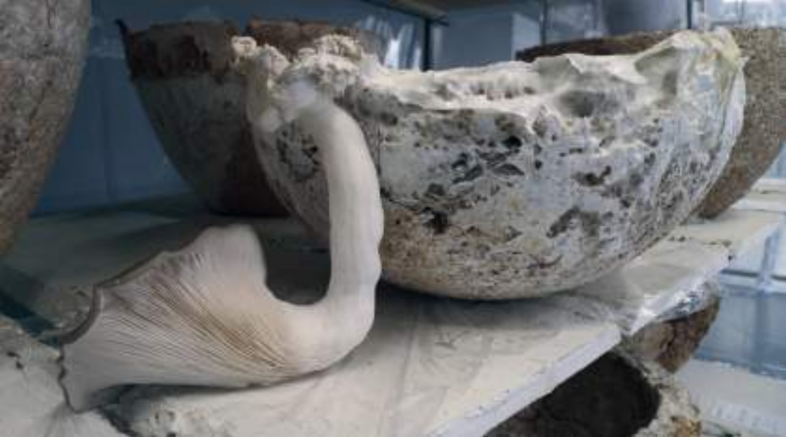
32nd Biennial Exhibition - "Living Uncertainty." Biotechnological artifact made with mycelium, by Nomedá and Gediminas Urbonas.

In the 32nd issue - "Living Uncertainty" 6 – discussions on cosmology and anti-racism were deepened, enriching the debates in subsequent issues. Fungi and mycelium, a topic in this issue, reflects the idea of the network, not only in its conventional form, but also in the communication between trees, like the configuration of the internet. This analogy highlights how different elements interact through connectivity or interference, resulting in systemic updates. Such a reference can broaden the agencies that give body to the relationships established within an educational experience.