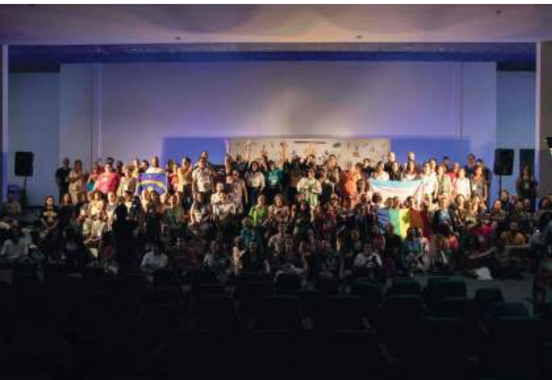
Image 4: 1st Museum education national meeting - EMUSE. Cachoeira-Ba/2023

and revisions of the PNEM, also contributing to the evaluation of those aspects of the National Museum Policy, established in 2003, that deal with museum education and, consequently, with IBRAM's public policies in this area (PEMBRASIL, 2023).