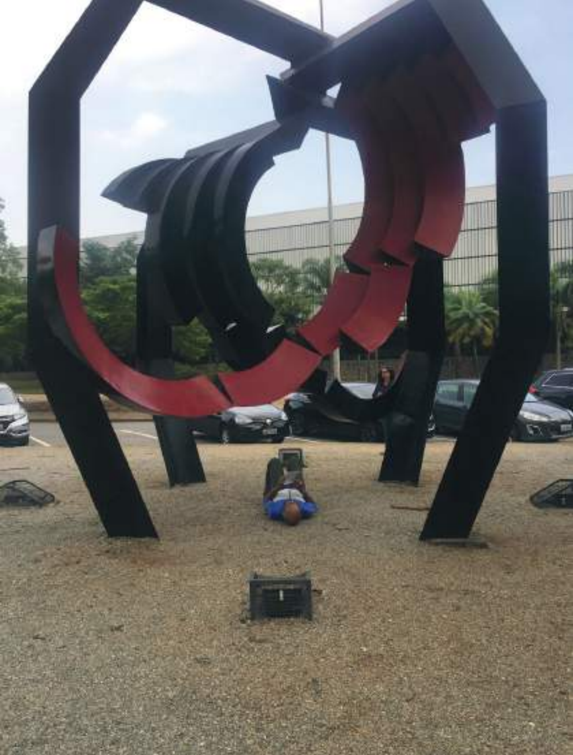
Practicing "Invitation to Attention" with a course participant. Parque do Ibirapuera , São Paulo.