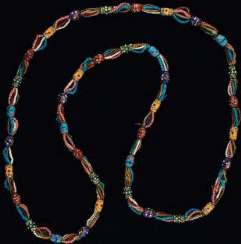
Rosary. Nosso Sagrado/Museu da República.