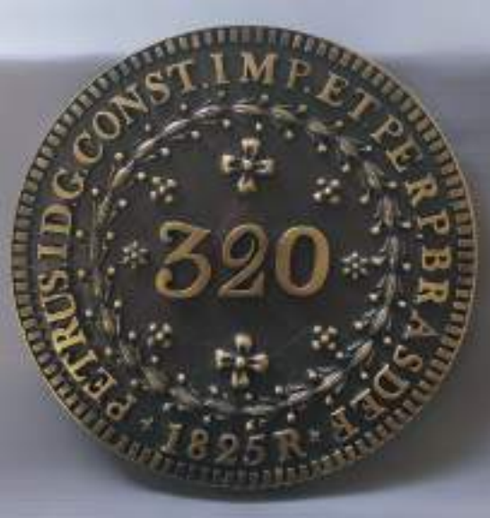
Image 2: Enlarged reproduction of a Brazilian Imperial coin of 320 réis. Digital photo, Thamar Nunes & Luisa Barcelli, 2022. Archive: CCI-TUO-RET-001_1.jpg

bringing students closer to the themes dealt with in the exhibition spaces. In addition, training was given to the teams that started operating the Museum in September 2022, especially those linked to the ticket office and security.