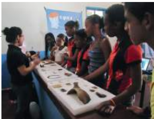
2. Exhibition mediation as part of the museological planning of the Museum of the Alto Sertão of Bahia (2011)

From this experience, I would highlight the fact that I received effective training for my work, involving the discussion of texts in the field and contact with pedagogical resources, such as the thematic guides for the long-term exhibition “Forms of Humanity” and the museum’s educational kits. It was important to realise the role of the training offered to primary school teachers, since the classes attended by the educational team at the exhibition were brought by teachers who had necessarily had a training experience at the museum itself. As my internship was in the field of history degrees, my contact with the educational programme was basically in these school contexts.