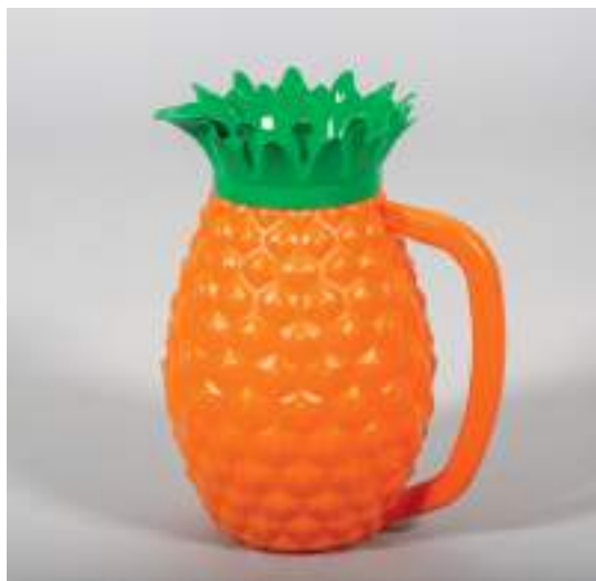
Image 4: Plastic jar in the shape of a pineapple. Digital photo, Hélio Nobre & José Rosael, 2022. Archive: CEC-Co2-OBT-010_1.jpg

Physical and communicational accessibility was adopted as a premise for defining the new exhibitions, as previously mentioned. In addition to audio description resources, Brazilian Sign Language (Libras) and texts in ink and Braille, it was decided that all the