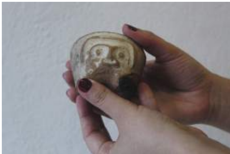
Image 5 Handling an Amazonian archaeological fragment from the teaching collection, Guarita pottery - 9th to 16th century AD.

We can criticise how archaeology is a state practice that can alienate people from their heritage references, so it is always necessary to evaluate it is applied to each reality 5 . The experience of lending these kits to teachers to use in the classroom has over the decades brought archaeological materiality closer to different people who wouldn't have had access to such objects. It's important to note that during this time there have been few cases of damaged items and no cases of lost material. In other words, the benefits of making archaeological and ethnographic collections available to the public are far greater than the fear of their destruction. Currently, an average of 15,000 to 20,000 students borrows all the museum's educational