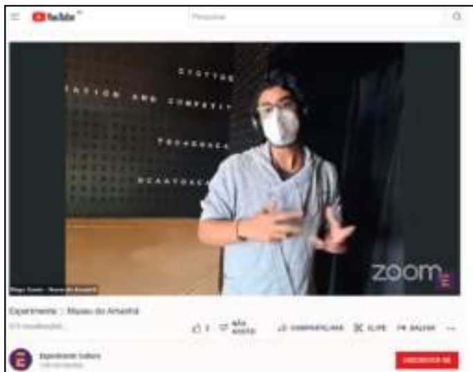
Figure 1: During the pandemic, the Museu do Amanhã (Museum of Tomorrow) started its interactive programme of digital mediated visits called «Televisitas», the image shows an educator talking live to viewers who were following the visit at distance.

activities promoted by museums were respectively Youtube (64.7%), the museum's website (54.5%) and Instagram (53.5%) (Figure 1).