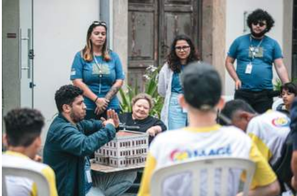
Image 4: Mediation with a group of hearing-impaired people.

approach. Hélio Oiticica's sentence "Experimenting the experimental" became a motto, as did Mario Pedrosa's phrase, "Experimental exercise of freedom". Hélio's slogan "experiment with the experimental" was maximised during visits and turned into an experience.