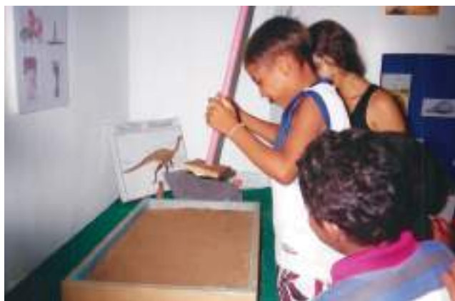
Figure 4 - Experiments on fossils (2005)