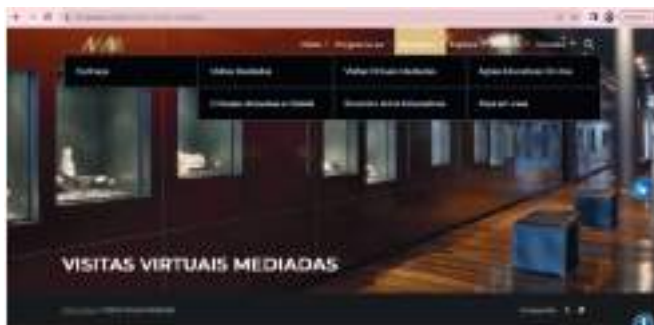
Figure 2: In 2023, MM Gerda u will have the possibility of scheduling Mediated Virtual Visits and learning about the museum’s Online Educational Actions on its website, in the Education area.

In this context, one finds visits in which educators are in the geolocated museum and circulate around the exhibits in the institution’s physical space, as well as visits in which educators don’t necessarily need to be