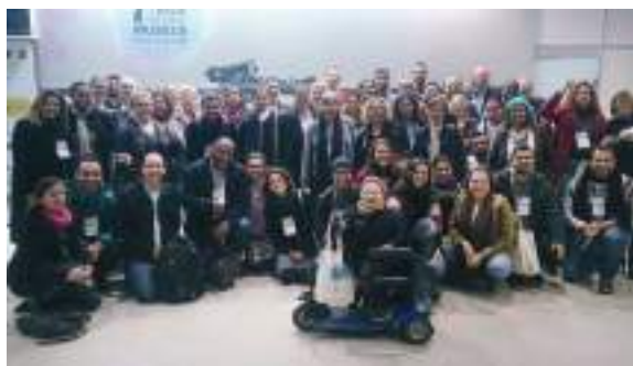
Image 2 : PNEM second national meeting. Porto Alegre-RS/2017

At the time of the request for participation with IBRAM to the organization of the 1st National Museum Education Meeting, a Provisional Management Committee was created in 2018 within the