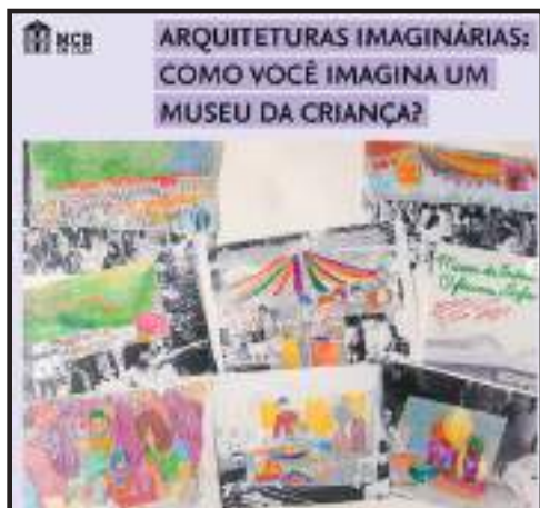
IMAGE 2- Publication to publicise the results of the workshop “Imaginary Architectures: how do you imagine a children’s museum?”, 2021.

Finally, it should be noted that Russio’s ideals around the Museu da Criança are still relevant today. Following her ideal, the research also endeavoured to propose workshops based on her proposals, such as the workshop “Imaginary Architectures: how do you imagine a Children’s Museum?”, held at the Museu da Casa Brasileira (2021), which results were exhibited at the 13th São Paulo Architecture Biennial, communicating its contemporary and pulsating aspects regarding museum education and Brazilian museological issues today.