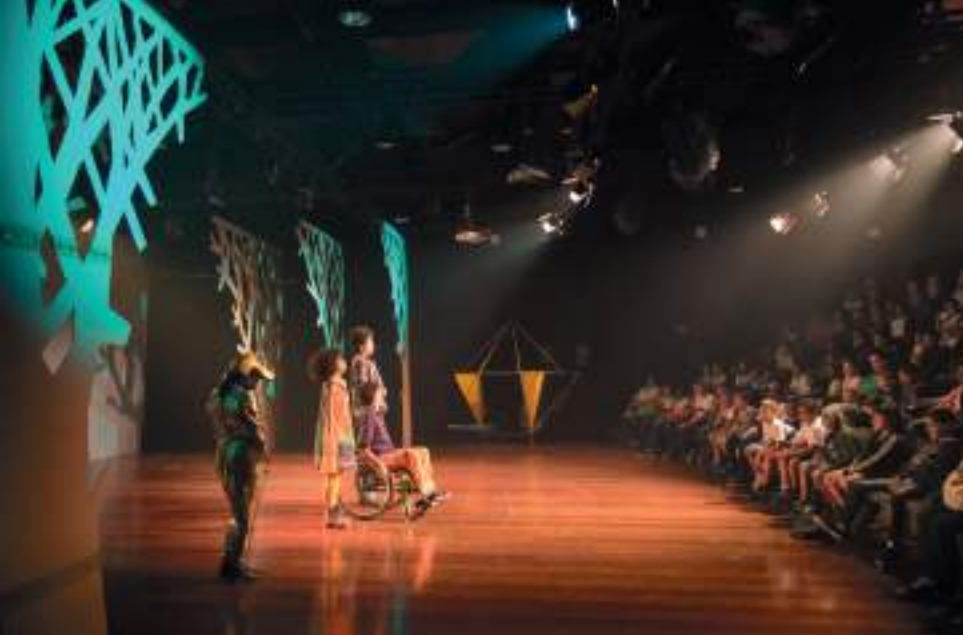
Figure 2: The theatre show O Grande Problema da Banda Infinita (The Big Problem of the Infinite Band), performed in the Science Tent, Fiocruz Museum of Life, by Ciência em Cena (Science on Stage) actors for primary school students

originating from them and fuelling them, which in turn makes it possible to attribute meaning to concrete life experiences (Schall, 2005).