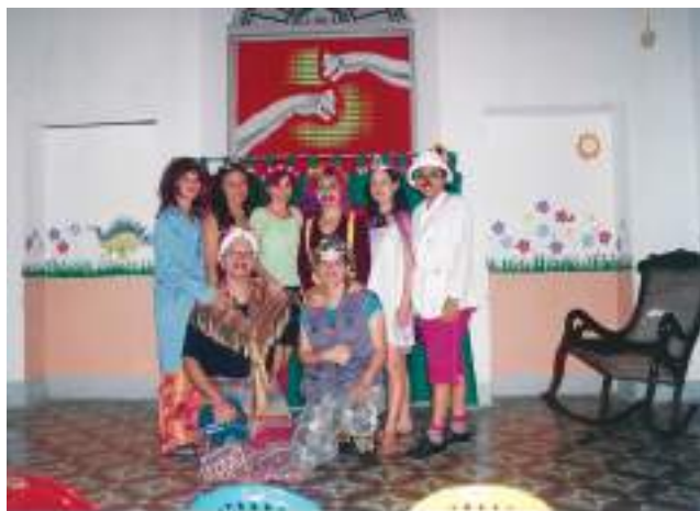
Figure 2 - Terra Brasilis Week team (2005)