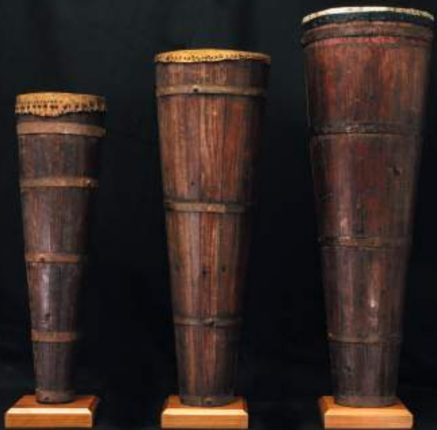
Atabaques. Nosso Sagrado/Museu da República.