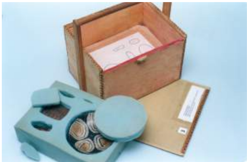
Image 4: Archaeology and Ethnology Educational Kit in the early 1990s.

With the growing demand for this service, they decided to reverse the process and invite the teachers to come to the MAE for training after what they could then take the kit to the classroom 3 .