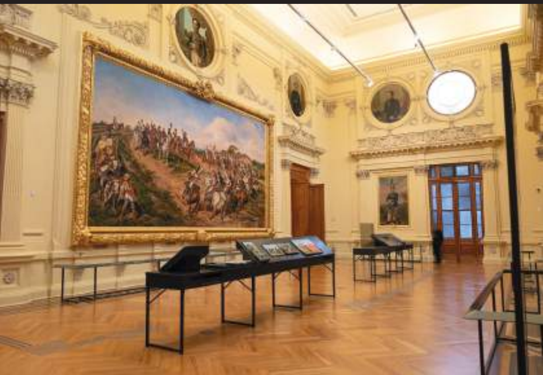
Image 1: The Noble Salon of the Museu do Ipiranga with the painting "Independence or Death" and accessibility material in the exhibition.