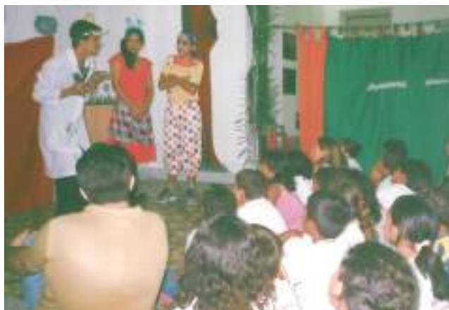
Figure 3 - Representation of «Stumbling into Prehistory» (2005)