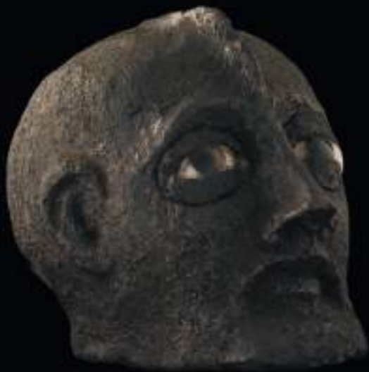
Exu Ijelú/Exu Lalu/Caboclo Lalu. Nosso Sagrado/Museu da República.