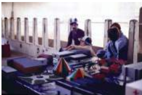
IMAGE 1 - Children’s workshops at the Museum of Industry, 1979. 5