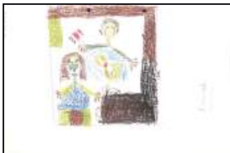
IMAGE 3 - Drawings made by MOBRAL students on a visit to the Pinacoteca do Estado collection. 16