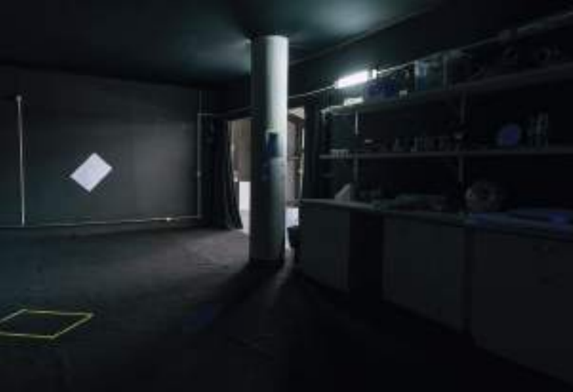
30th Biennial Exhibition - «On the brink of poetics.» 4

Photo of the light studio - an unconventional studio with black walls, like a photographic darkroom, where visitors in groups carried out luminous and ephemeral experiments.