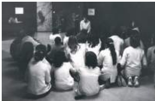
1. Educational activity at the Prehistory Institute of the University of São Paulo (IPH-USP).