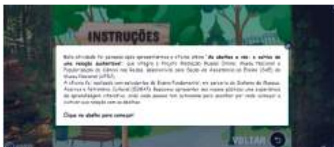
Figure 3: Screenshot of the online activity “Bees and Us: cultivating a sustainable relationship”, on the Genially platform, developed by the Teaching Assistance Section (SAE) of the National Museum - UFRJ, as part of the project for online museum mediation and the promotion of educational activities in the digital network.