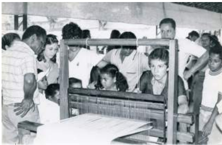
IMAGE 4 - Photograph of the Children's Workshops organised by the MICT in Água Branca Park in 1979. 17