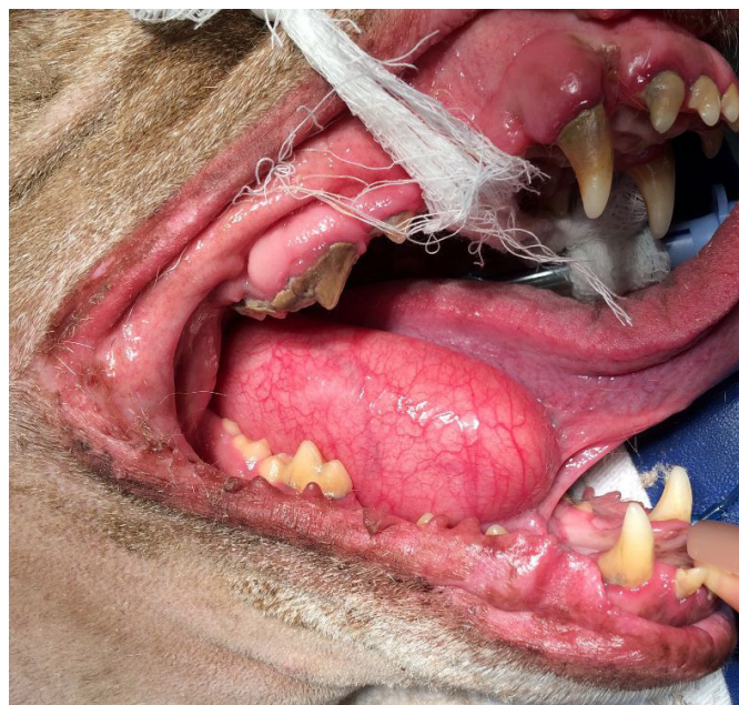
Figure 1 - Right-sided soft tissue swelling in a female Pit bull dog. Location is consistent with the sublingual salivary gland.

this study was a female; likewise, female dogs were affected in two of three cases reported in literature (Clark et al., 2013; Rodiño Tilve et al., 2017).