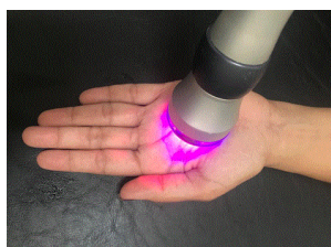
Figure 1: The ultra-laser prototype in use. The equipment was assembled to emit ultrasound and light field at the same time. For fibromyalgia, the treatment proposed was on the palm of hands.

This research used an ultra-laser prototype, equipment developed by the Technological Support Laboratory (LAT) of the Institute of Physics of São Carlos (IFSC), University of São Paulo (USP). The prototype consisted of a therapeutic ultrasound assembled together to a low-level laser source, enabling ultrasound and light emission by the transducer (Figure 1).