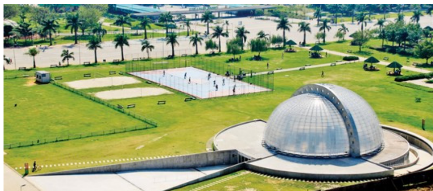
Figure 2. Villa-Lobos State Park [19].

The selection criteria were similar characteristics such as land use and occupation and source of pollution; operation period and deactivation of the polluting source; contaminated compartments (soil, surface, and groundwater); and considered as a successful case of requalification of waste-contaminated area and the current or future use of the area.