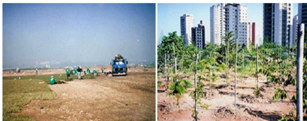
Figure 7. Building of Villa-Lobos State Park in 1989 [24].

In 1989, the Villa-Lobos State Park began to be deployed, starting with earthworks, Figure 7.