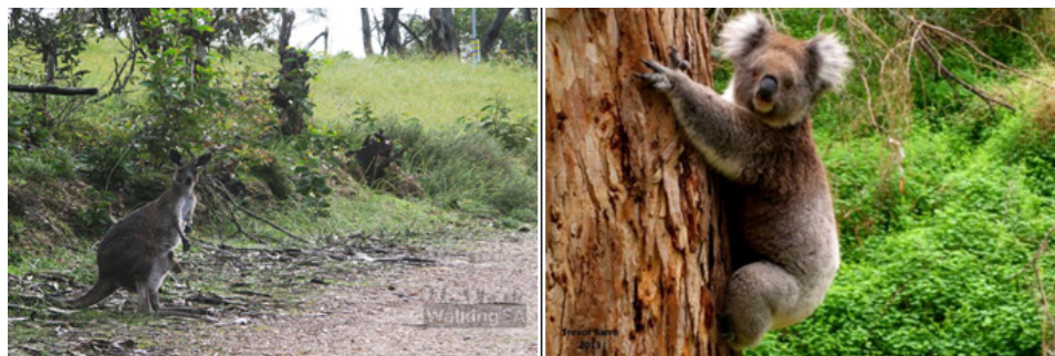
Figure 9. Chambers Gully Park, Adelaide, Australia [39].

According to CONAMA Resolution No. 420/2009, the process of recovery of contaminated areas does not guarantee the promotion of environmental quality prior to contamination, as it aims to adopt corrective measures based on the set of actions aimed at isolating, containing, minimizing, or eliminating contamination, enabling them to be recovered for a use compatible with the established goals, thus adopting the principle of declared use. With this rehabilitation of the area, a new occupation is possible, whether residential, commercial, or agricultural, a procedure adopted worldwide.