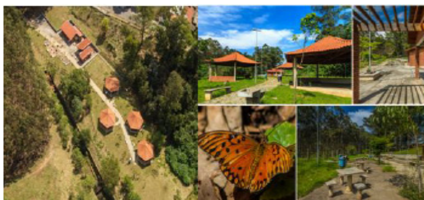
Figure 1. Municipal Park Jardim Primavera [18].

The first case selected was the contaminated area of the Jardim Primavera Municipal Park (Figure 1), inserted at the eastern part of the municipality, in the district of Vila Jacuí, in São Miguel Paulista.