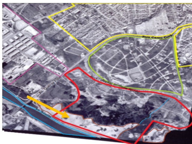
Figure 5. Villa-Lobos site. Earth movement in the south part of the area in 1968 [19].

During this period, near the site where the administration of the park operates nowadays, an area was identified that received metal materials for recycling, apparently scrap from underground storage tanks. The surroundings at that time had the same characteristics as in 1968, but with increased occupation (Figure 6).