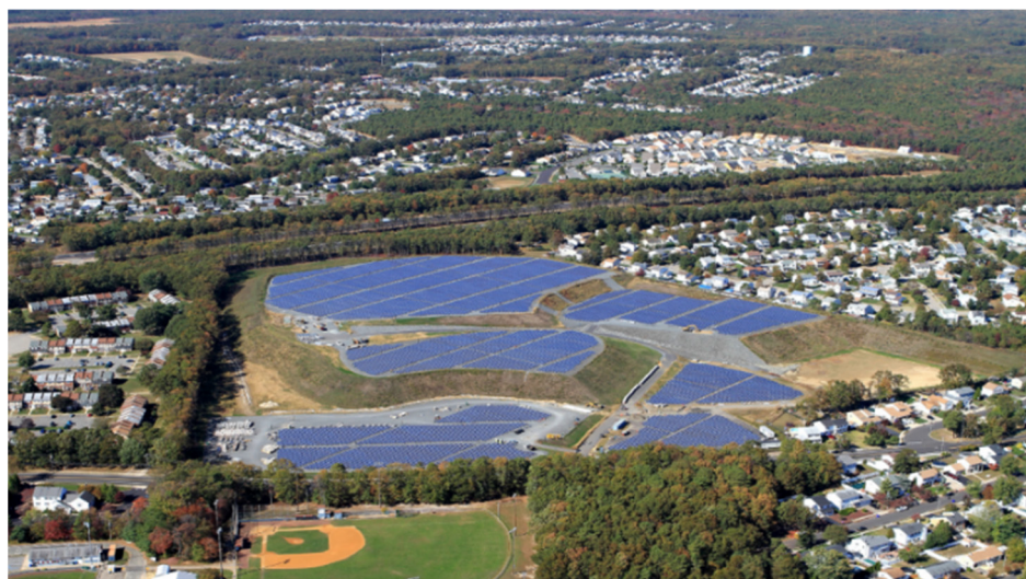
Figure 8. Brick Town landfill. Solar panel view [38].

Another important situation is the direct insertion of the population even before the elaboration of the project, as in the case of Villa-Lobos Park, where it ended up stimulating environmental education, not only to inform about the problem, but to provide sufficient and adequate knowledge for better understanding, transparency, and decision-making regarding the problem [38]. In addition, with the creation of the Orientation Council of the Villa-Lobos State Park, the State was able to arouse community interest, later counting on its support, dialogue and dissemination of all actions concerning the requalification process of the area, in a receptive and transparent way.