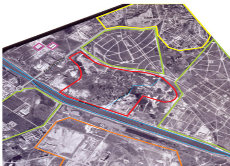
Figure 4. Villa-Lobos site. Occupation of the area and neighborhood in 1958. Colors: Red: Villa-Lobos Park Area; Brown: Earth movement; Green: green area/allotment; Blue: Body of water; Yellow: residences; Purple: industries; Orange: University of São Paulo [19].

Villa-Lobos State Park is already finished and in use. It belongs to the government of the state of São Paulo. In the area of the park, located in an old floodplain of the Pinheiros River, the occupation began in 1958, where it presented grassy vegetation, some paths of earthmoving and the Boaçava stream (Figure 4).