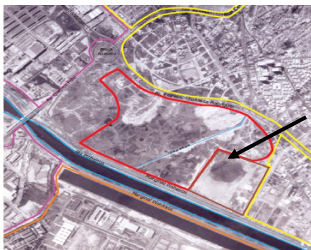
Figure 6. Villa-Lobos. Disposal of dredged material next to the old sand mine in 1977 [19].

During this period, near the site where the administration of the park operates nowadays, an area was identified that received metal materials for recycling, apparently scrap from underground storage tanks. The surroundings at that time had the same characteristics as in 1968, but with increased occupation (Figure 6).