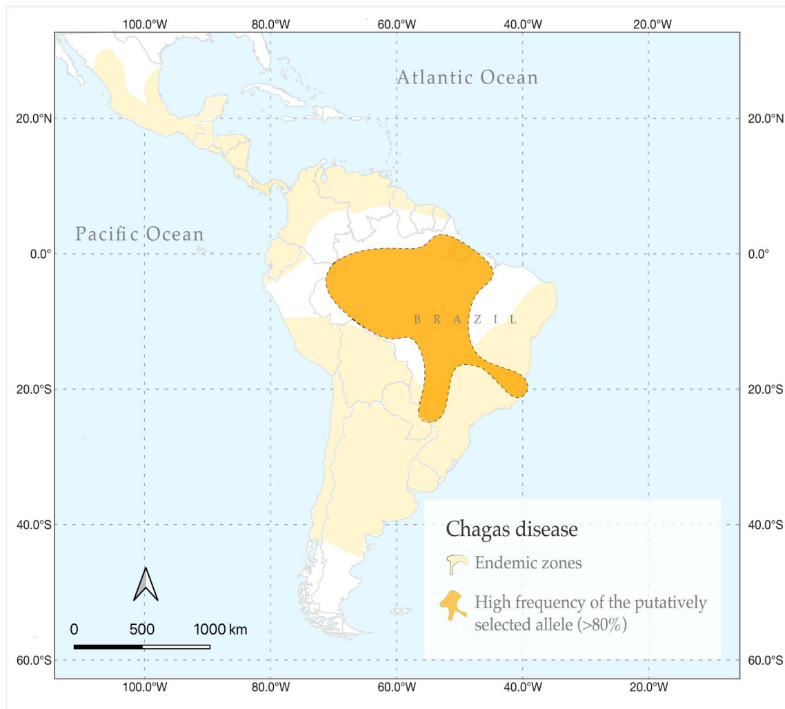
Fig. 3. High-frequency distribution of the putatively selected PPP3CA allele. The yellow area on the map represents the endemic region of Chagas disease. The orange area represents the distribution of the putatively selected allele (rs2659540 G>A) in the studied populations.

hg19 to the current genome assembly, GRCh38-hg38. Individuals with more than 10% of missing data and those SNPs with minor allele frequency (MAF) lower than 5% or with more than 1% of missing data were removed. We further computationally phased the data using SHAPEIT2 (55) and the recombination map files from the 1000 Genomes Project (56) to phase the haplotypes. No reference panels were used because of the peculiarities of evolutionary history and the lack of representation of Native American populations in these panels. We used the ancestral and derived allele information annotated in the 1000 Genomes Project from EPO pipeline (56), according to Ensembl FTP site ( http://ftp.ensembl.org/pub/release-71/fasta/ancestral_alleles/homo_sapiens_ancestor_GRCh37_e71.tar.bz2 ), and removed SNPs without such information so that our final phased and polarized datasets contain 517,984 SNPs.