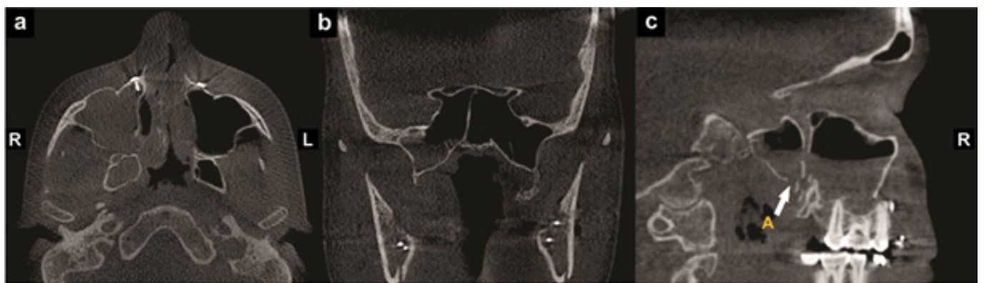
Figure 2. Postoperative CBCT exam for orthognathic surgery, showing the SS'opacification on the right side in multiplanar (a) axial, (b) coronal and (c) sagittal reconstructions. The fracture in the floor of the SS is observed in sagittal reconstruction (c-A).

In the immediate postoperative CBCT image (figures 2a-c), it was found a hyperdense image of the SS only on the right side with compromise of the floor, due to the factors related to the transoperative period. Among these, can be the greater force applied in the right side associated with greater resistance at the moment of pterygomaxillary disjunction, because individuals with CLP have scarring fibrosis areas and bone more sclerotic. In addition, the fixing and immobilizing the plates (forcing the right side more) or the chisel positioning at different heights can also justify this harm. The hyperdense image of the SS is horizontally level and suggests an extravasation liquid content inside (figure 2c-A). On the left side, the procedure was performed with no sphenoid sinus walls involved.