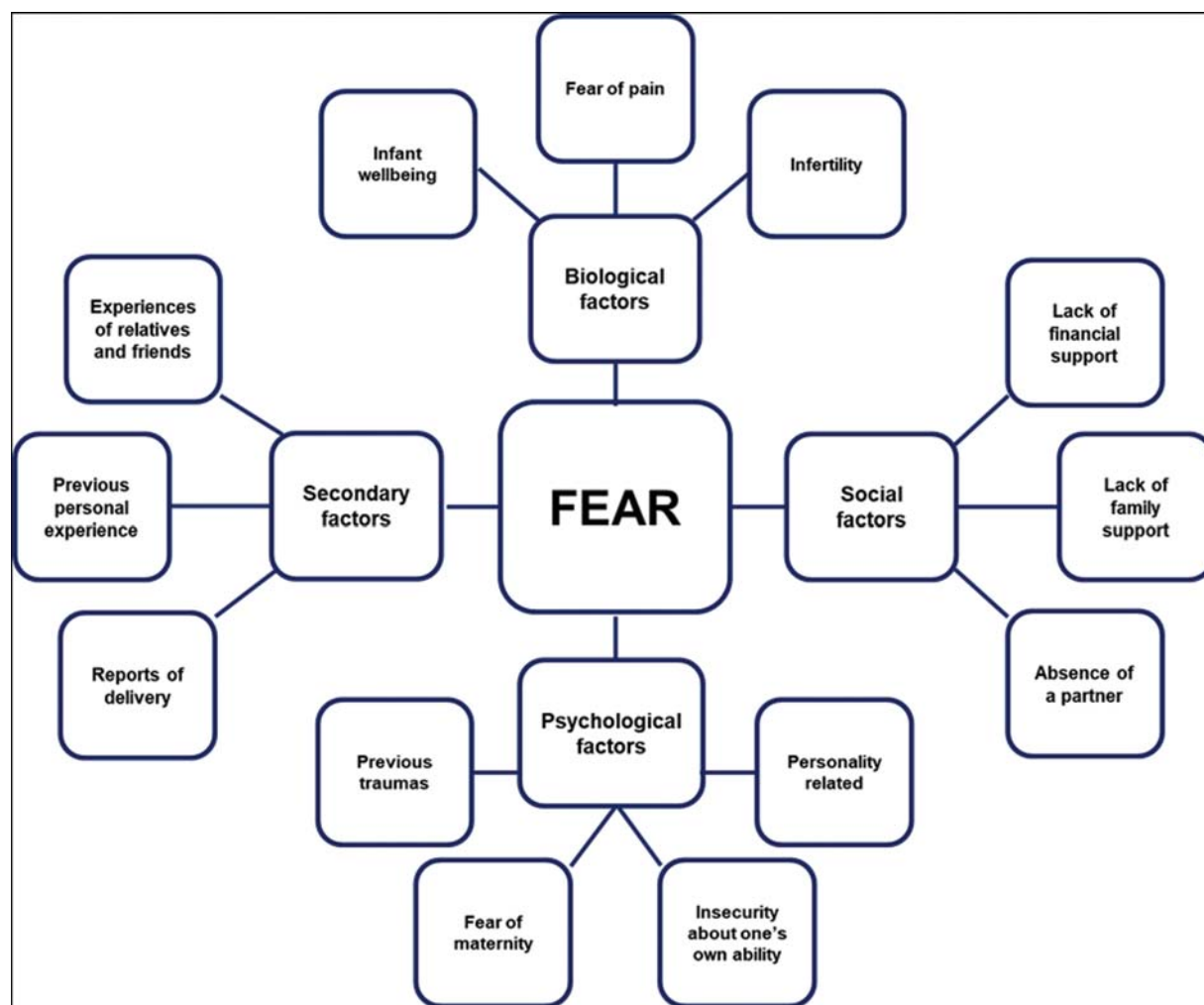
Fig. 2. Factors influencing fear of childbirth. Source: Adapted from Wijma et al. (2002), 24 Saisto et al. (2003), 5 Ternström et al. (2016), 25 and Dencker et al. (2019) 26

and with an increased risk of spontaneous preterm birth (OR = 1.41; 95%CI: 1.13–1.75). 40