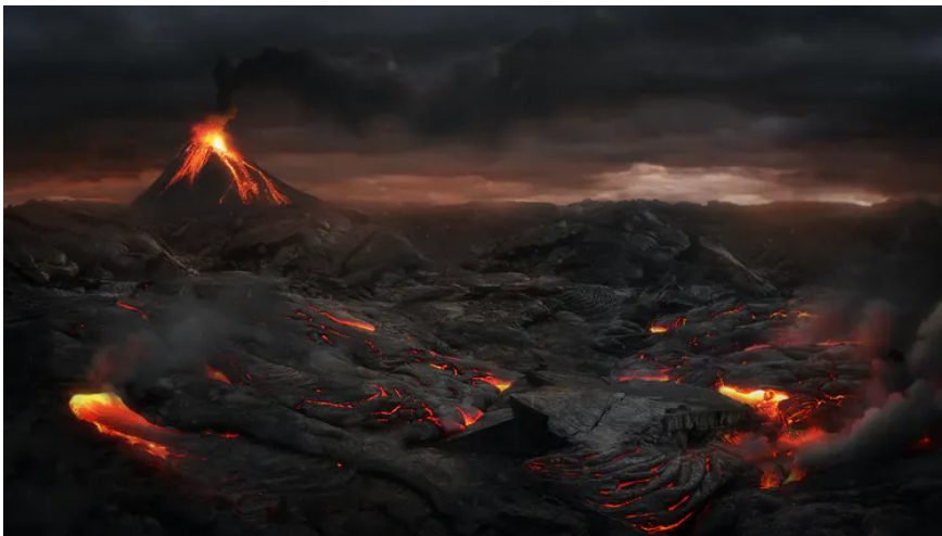
An artist's rendition of a post-volcanic eruption landscape.

One extremely important factor to consider is the exact age of the LIP relative to the mass extinction. If the ages of the climate change, associated mass extinction and the LIP do not overlap, then the volcanism is not the cause.