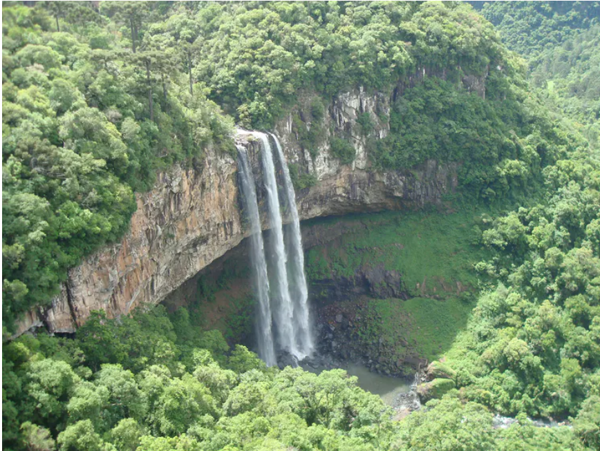
Volcanic rocks (dacites overlying basalts) from the Paraná LIP related to the opening of the South Atlantic Ocean at Caracol State Park, in Rio Grande do Sul, Brazil.

Many studies have suggested that this LIP caused global climate change which led to a small mass extinction and also a reduction in the oxygen concentration in the oceans. This period is called the Valanginian event .