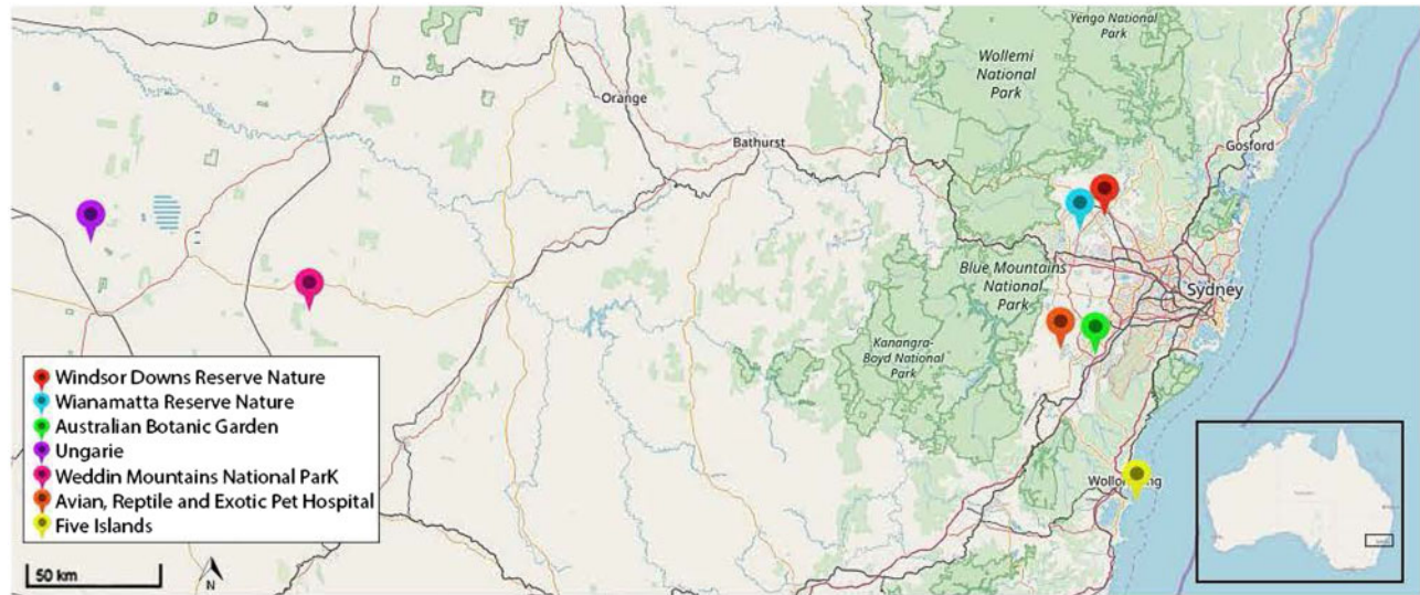
Figure 1. Map of Southeast Australia showing sites where wild birds were caught in mist nets and sampled and location of the University of Sydney Avian Reptile and Exotic Pet Hospital.

DNA was not detected in the samples from native doves and pigeons or the two Eurasian collared doves. The ten swabs from the clean bags (negative controls) were negative for adenovirus DNA. Sequencing with reverse primers of sixteen amplicons resulted in additional sequence data for samples from a long-billed corella and a bowerbird.