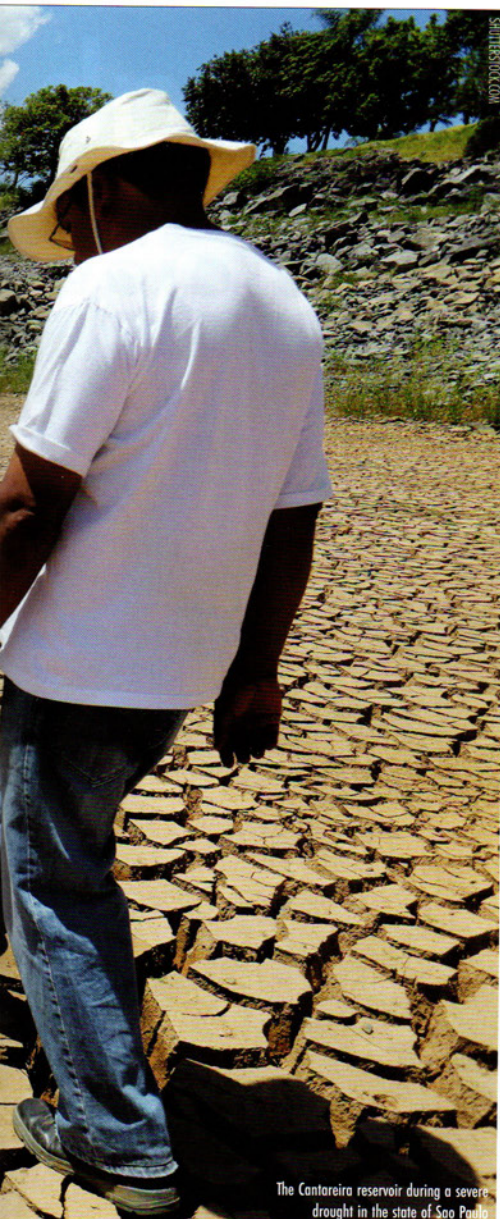
The Cantareira reservoir during a severe drought in the state of São Paulo